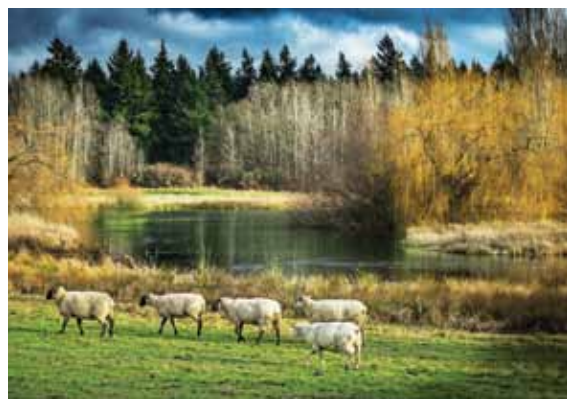
Sheep Karlana Pickering

options, reduced shop hours, fewer people out and about. The weather is wet with highs in the 40s-50s. Average yearly rainfall is between 19-25 inches—about half of that in the neighboring Seattle area. We see an occasional snow shower in the winter, but it never lasts long. Spring and Fall can be warm, cold, wet or dry...or just about anything in between! It's best to layer clothing and always have a lightweight jacket or sweatshirt handy. Year-round dress is casual.